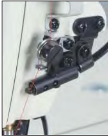
Needle thread draw-out mechanism

The machine comes with a silicon oil lubricating unit, thread spreading mechanism and thread trimming mechanism which trims the thread without fail, thereby consistently ensuring beautifully-finished seams for light- to medium-weight materials. The appearance of the machine is restyled, and it is now colored in a refreshing urban white.