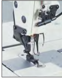
Needle thread clamp mechanism and sliding presser foot